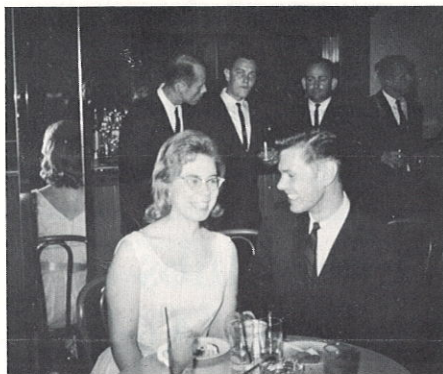
This single-set dance was a success!

The local single set recently experienced the second fun-filled highlight of this year's planned activities. On the Saturday night of February 16, one of the spacious ballrooms in the Elk's Lodge in Pasadena provided just the right setting for a very enjoyable dance!